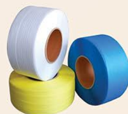
PLASTIC P.P. BOX STRAPS